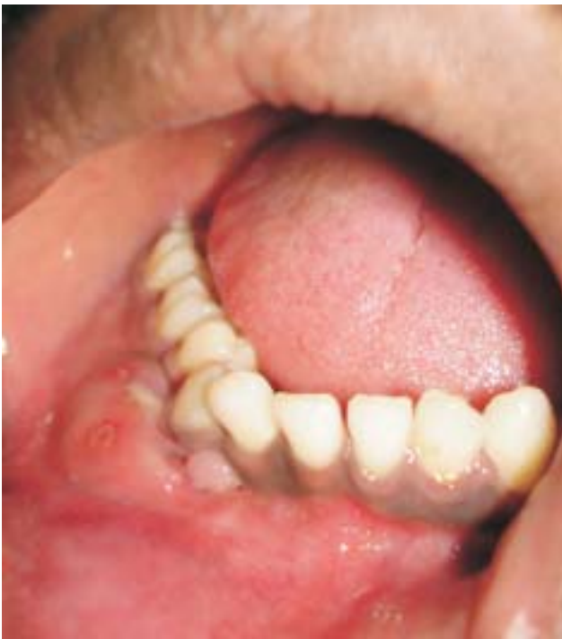
FIGURE 2 - Diffuse swelling in the right labial and buccal sulcus

Intraoral examination revealed a diffuse tender swelling in the right labial and buccal sulcus (Figure 2) extending approximately from 42 to 46 and obliterating the labial and buccal sulcus with obvious pus discharge observed in relation to the gingival sulcus related to 44. 18, 28 and 43 were not visible in the oral cavity.