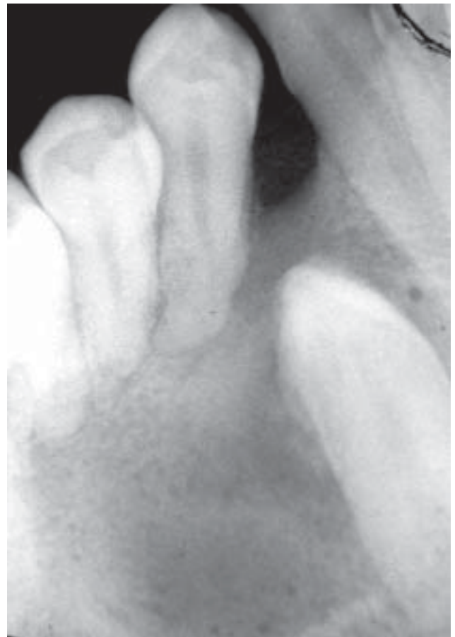
FIGURE 3 - Periapical radiograph revealing a well defined radiolucency in relation to the crown of the 43

Periapical radiograph of the region of the 43 (Figure 3) revealed a well defined radiolucency with well corticated margin in relation to the crown of impacted 43.