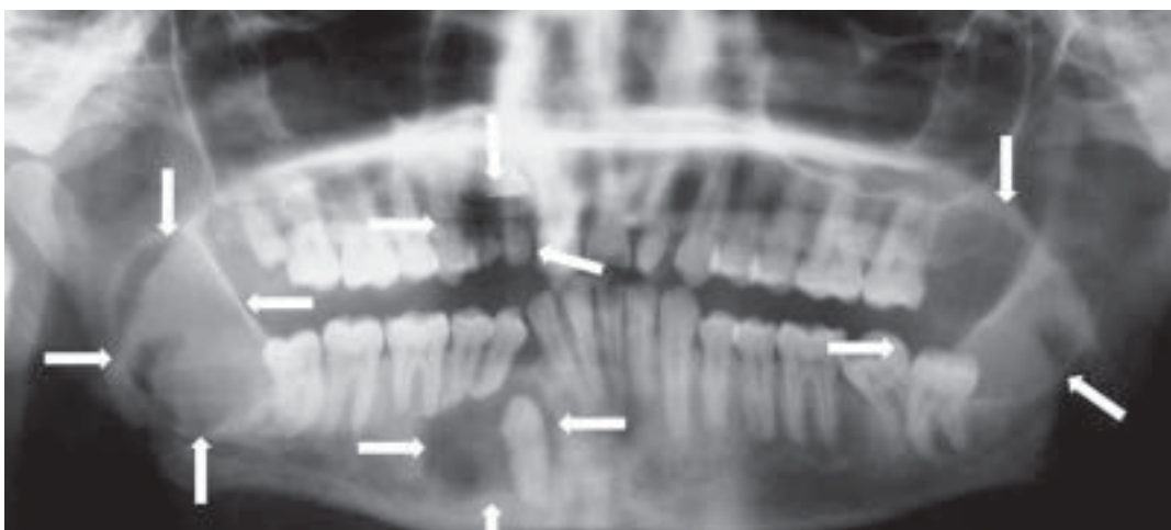
FIGURE 4 - Panoramic image showing four cyst-like radiolucencies in upper and lower jaws

Panoramic radiograph (Figure 4) revealed four cyst-like radiolucencies in upper and lower jaws.