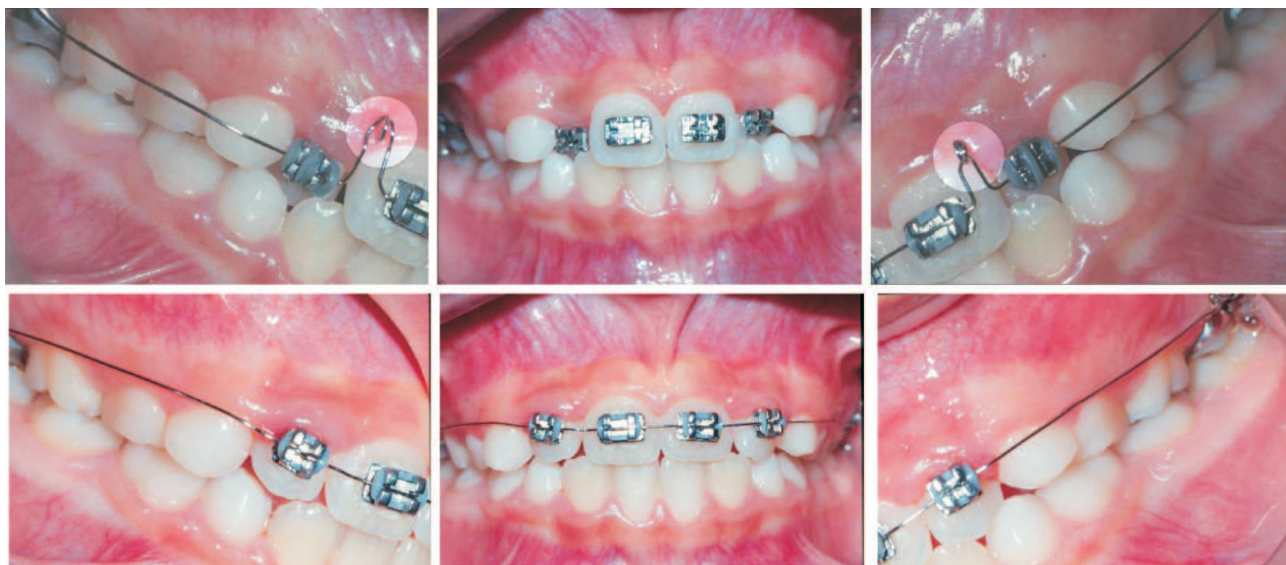
Figure 4 B - 10 years 10 months. Brackets on upper incisors. Bands on first permanent molars. Double helicoidal multiloop .016" stainless steel arch wire medial to crossed lateral incisors. Four weeks later, .016" stainless steel arch wire with offsets on almost uncrossed lateral incisors