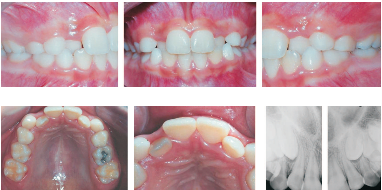
Figure 4 A - 10 years and 10 months. Angle Class I malocclusion. Cross-bite of both lateral incisors, without space for alignment. Peri-apical x-rays showing the developmental stage of canines, about one third of the way down the lateral roots