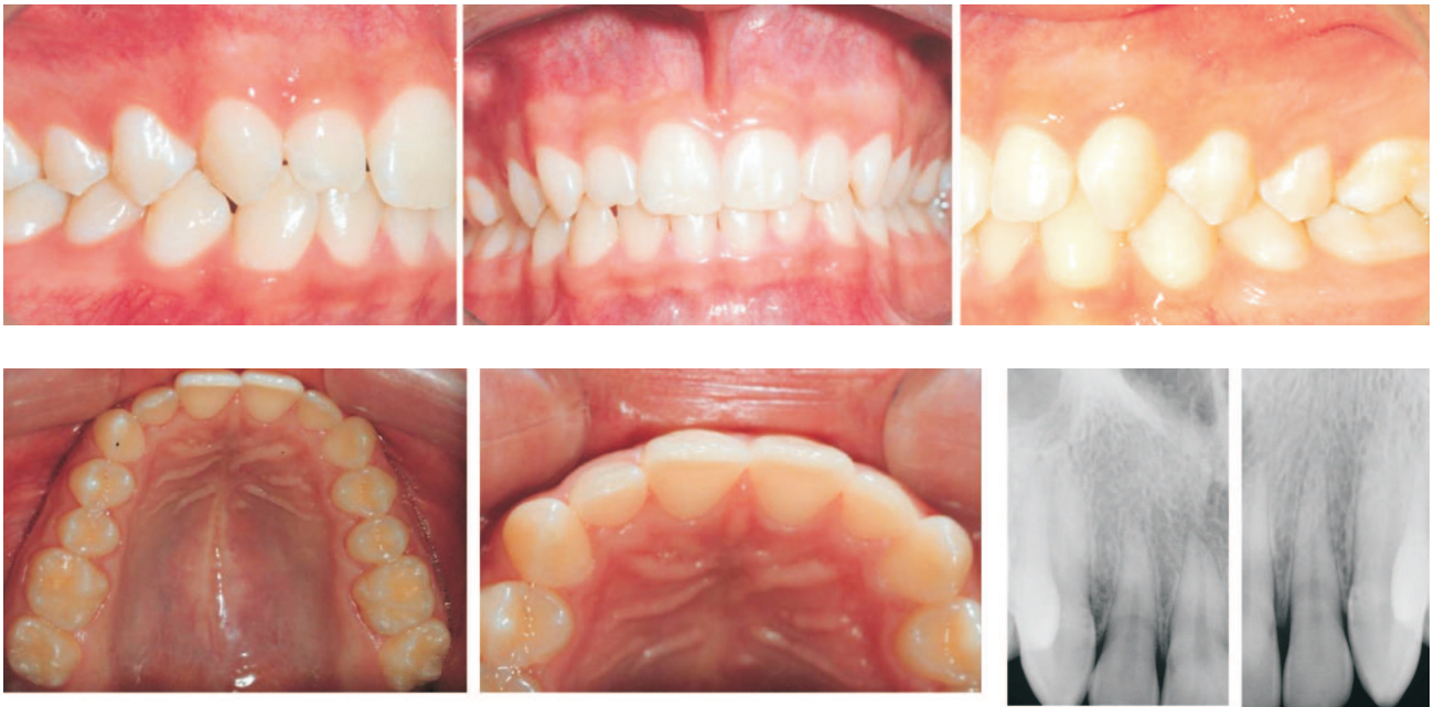
Figure 4 D - 18 years 11 months old. Permanent dentition without corrective orthodontic treatment. Alignment and intercuspation are acceptable. Right and left laterality movement guided by canines. Protrusion movement with contact on incisors. Aspects of bone and radicular normality at this age