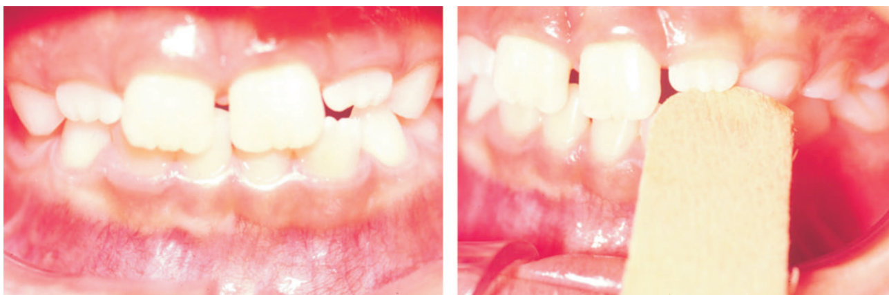
Figure 1 - The stick is oriented under the upper left lateral incisors erupting in the lingual position. Observe the ischemic area in the marginal gingiva of upper lateral incisors due to mild and constant pressure

Dental anterior cross-bite will happen when one or more upper teeth erupt lingually in relation to those lower teeth with which they should occlude, (4) and when the mandible is in maximum intercuspation (2) (Figures 1-4E).