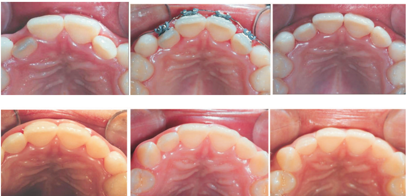
Figure 4 E - Occlusal view at 10 years 10 months old; 10 years 11 months; 11 years 9 months; 13 years of age; 14 years 7 months and 18 years 11 months of age