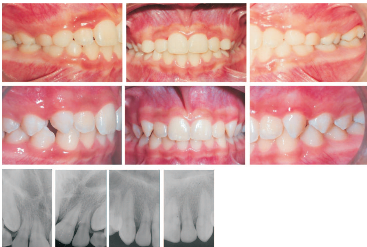
Figure 4 C - At age 13.0. Lateral incisors are maintained uncrossed. 14 years 7 months. Permanent dentition and acceptable aesthetics even with diastema between canines and first bicuspids. Radiographs showing end of mixed dentition with complete rhyssolysis of deciduous canines. In the permanent dentition, radicular normality of both lateral incisors and canines