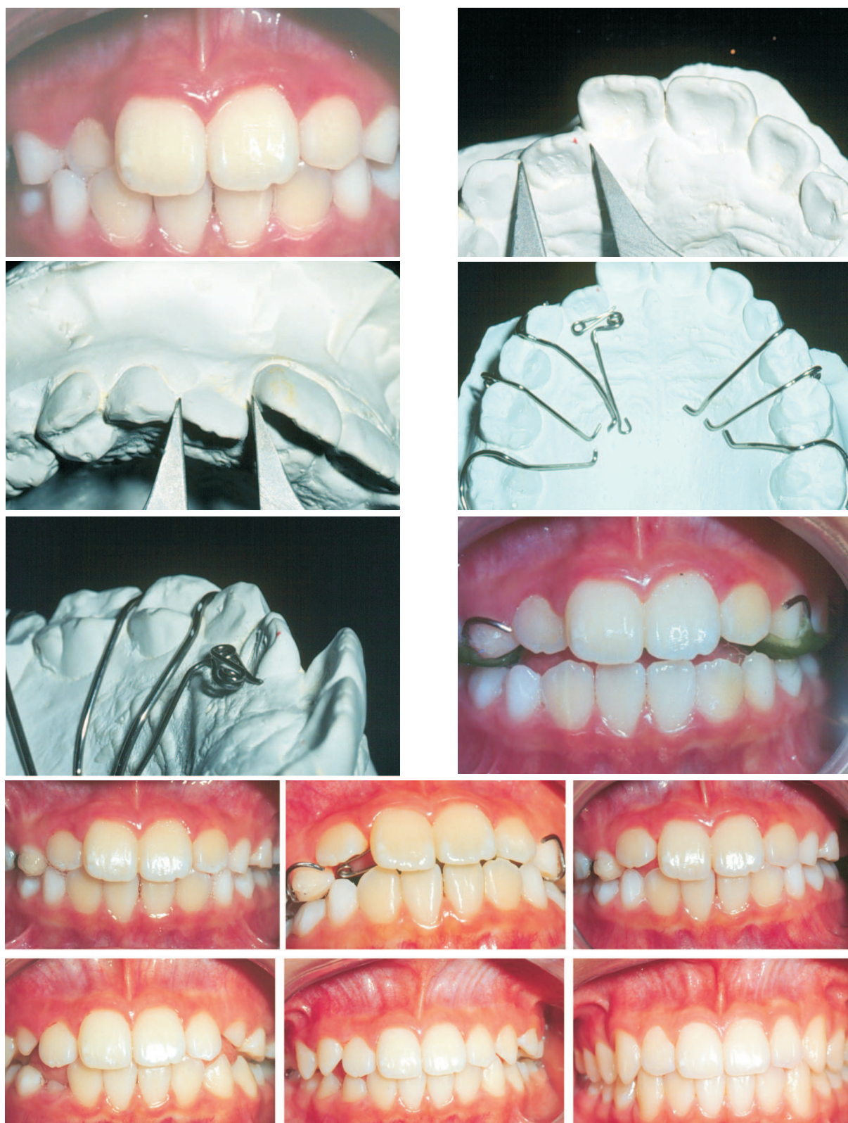
Figure 2 - Dental cross-bite of upper right lateral incisor is diagnosed. Enough space exists for the positioning in the line of occlusion. A removable appliance is installed with a occlusal bite plane and a double-helix digital spring adapted on cantilever. Observe normal gingival contour of the alveolar ridge of the lateral incisor