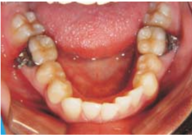
FIGURA 3 - Occlusal photograph of twin 1