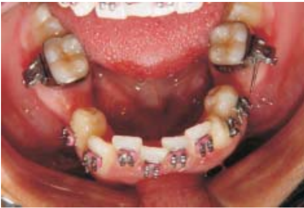
FIGURA 4 - Occlusal photograph of twin 2

The impacted teeth were extracted following the surgical technique (flap and sectioning) indicated in these cases. The surgical access of impacted canine was buccal in twin 1 (Figure 5), and the premolar was lingual in twin 2 (Figure 6).