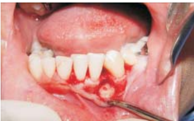
FIGURA 5 - Canine being extracted from buccal flap

The impacted teeth were extracted following the surgical technique (flap and sectioning) indicated in these cases. The surgical access of impacted canine was buccal in twin 1 (Figure 5), and the premolar was lingual in twin 2 (Figure 6).