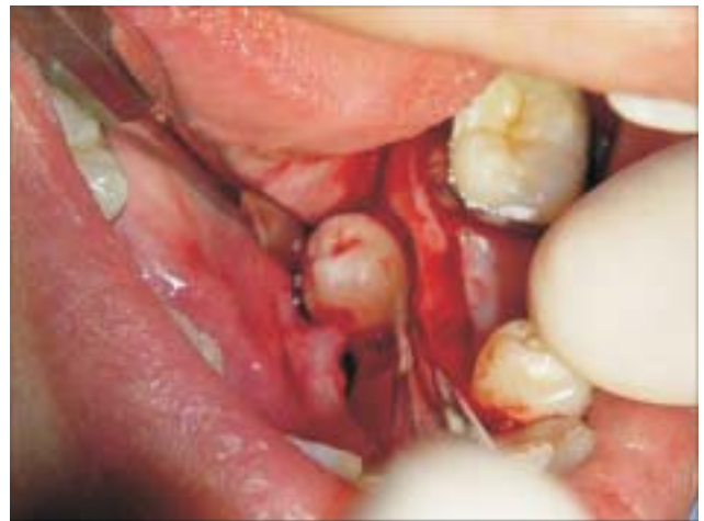
FIGURA 6 - Pre-molar being extract from lingual flap

After extraction and observation that it was an uncommon case, the parents were questioned as to possible events during pregnancy or growth of the twins that might lead to this unusual pattern.