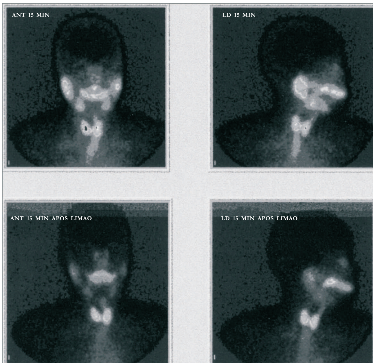
Figure 2 - After 6 months of stimulation with pilocarpine

The result of the examination revealed a severe dysfunction (excretion \leq 25\% ). The damage in the salivary gland was classified according to the scoring system proposed by Shizukuishi et al. (12). Treatment with pilocarpine was carried out over a 12-week period. The patient also underwent 6 months of follow-up treatment using the new sialoscintigraphy, following the same protocol applied in the first examination, to assess the amount of active parenchyma. The examination proved that the medication was effective. Moreover, after 6 months of stimulation with pilocarpine, the production and secretion of saliva increased on the right side, with a minor improvement on the left side. Therefore, the classification was changed to moderate dysfunction (25% excretion rate, 25 - 40%) (Figure 2).