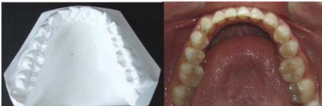
FIGURE 6 - Occlusal view before (orthodontic model) and after treatment (photo)