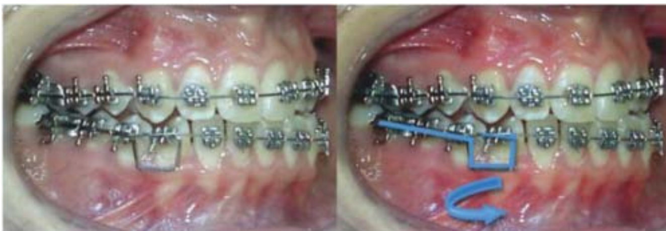
FIGURE 3 - Insertion of the segmented arch, "in Box" loop

Dental stripping with metal strips was performed to create space between the first premolar, canine and lateral incisor teeth. After treatment lasting two months, with monthly follow up, the position of the mandibular right canine was corrected. During the treatment, the other teeth were aligned with nickel titanium (NiTi) superelastic arch-wire, which added another two months to the treatment time. Bilateral intermaxillary intercuspitation was performed with 3/16-inch elastics during one month (Figure 4).