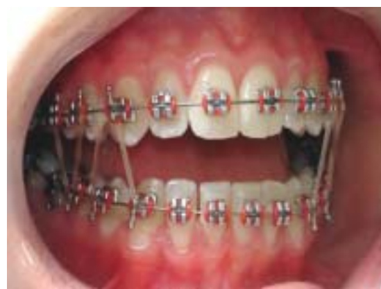
FIGURE 4 - 3/16-inch intermaxillary elastics

Dental stripping with metal strips was performed to create space between the first premolar, canine and lateral incisor teeth. After treatment lasting two months, with monthly follow up, the position of the mandibular right canine was corrected. During the treatment, the other teeth were aligned with nickel titanium (NiTi) superelastic arch-wire, which added another two months to the treatment time. Bilateral intermaxillary intercuspitation was performed with 3/16-inch elastics during one month (Figure 4).