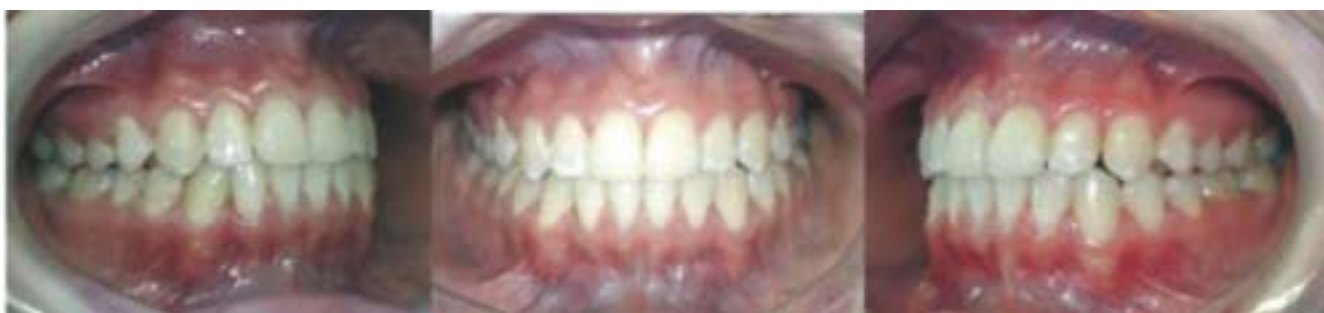
FIGURE 5 - Front and bilateral views immediately after the fixed appliance was removed

The fixed appliance was removed (Figures 5 and 6) and an Indirect Planas Track (IPT), a functional orthopedic appliance for a stable occlusal relationship was inserted (4).