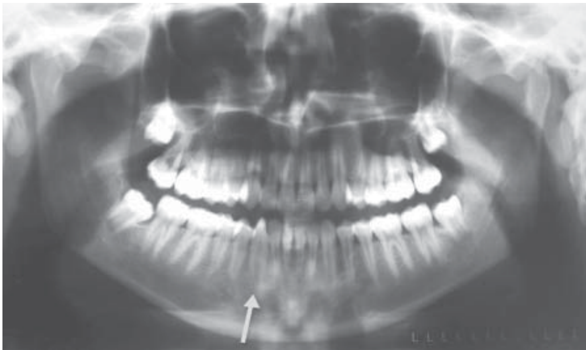
FIGURE 2 - Panoramic radiograph; arrow indicates the rotated canine

Treatment was performed by insertion of a fixed appliance: a 0.022-inch slot preadjusted. Roth appliance and standard mandibular lingual arch of 0.9-mm stainless steel for anchorage. The mandibular right canine rotation was corrected with a box loop