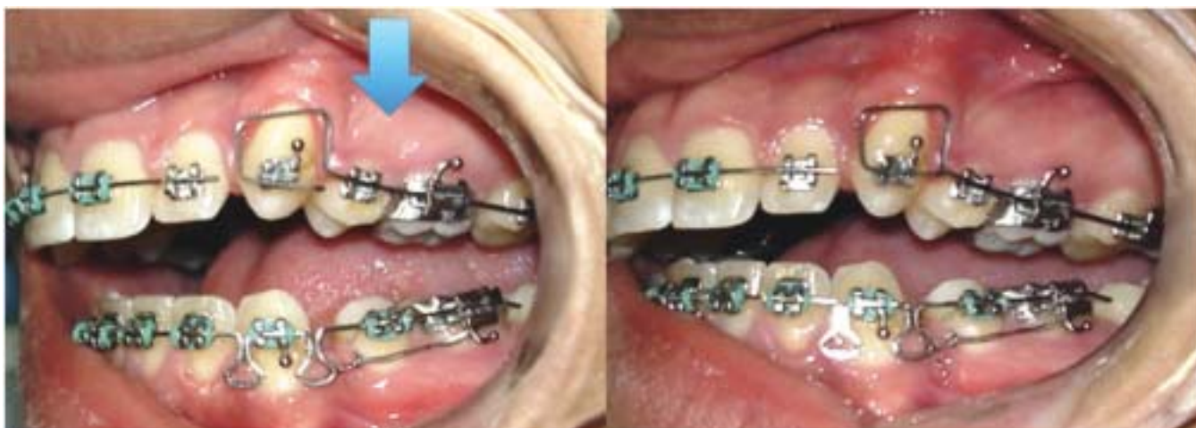
FIGURE 7 - Example of "in Box" loop use for canine extrusion

It can be quite complex to rotate a tooth on own axis by using the continuous arch-wire. In this case one can use the TMA segmented arch with the entrance to the bracket slot (box loop - Figure 3) in the opposite direction, which will allow only simple rotation. It can also be used for intrusion or extrusion teeth, as illustrated in Figure 7.