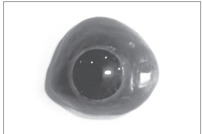
Figure 3 - Waxed up prosthesis with cornea

displacement during dewaxing. Processing was done in a manner similar to the normal denture processing using a long curing cycle with heat cure tooth coloured resin.