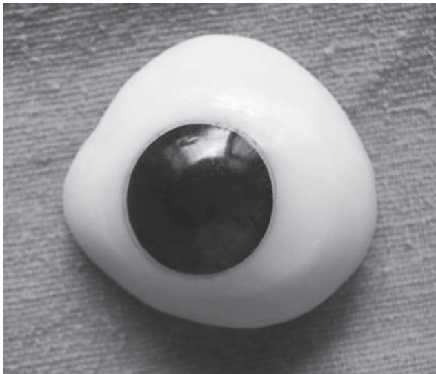
Figure 6 - Acrylized prosthesis

The acrylized prosthesis was then retrieved from the flask and trimmed to remove the acrylic handle and all irregular and sharp surfaces (Figure 6).