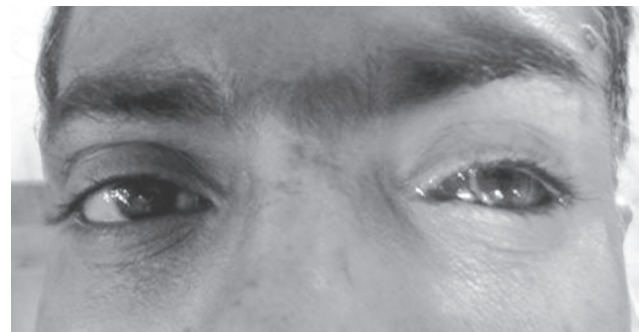
Figure 4 - Try-in process