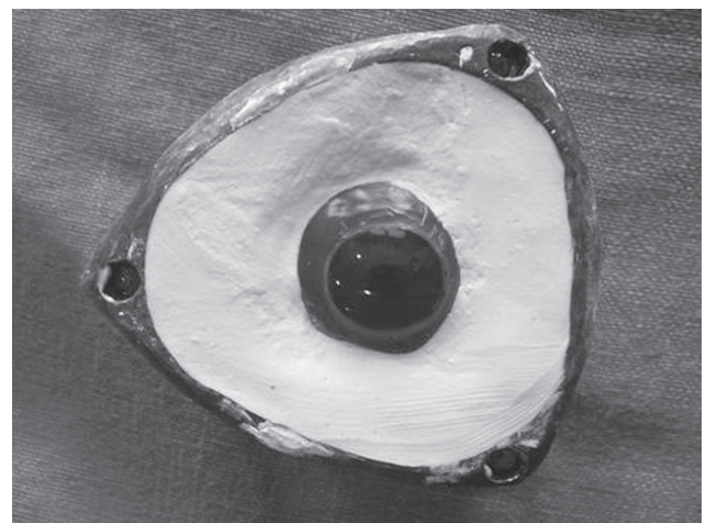
Figure 5 - Flasking in an ocular flask