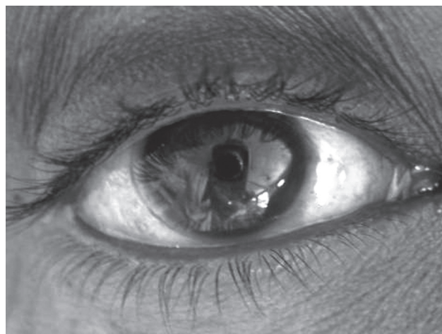
Figure 9 - Right normal eye used as a guide

As the patients demand for the aesthetics of the prosthesis were exacting and his wish to avoid wearing tinted glass spectacles (normally patient is