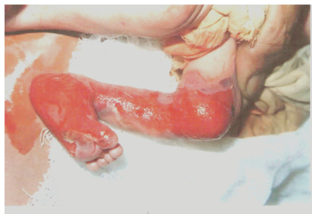
Figure 1 - Clinical presentation: denuded areas with raw eroded skin extending from the knee to the toes involving the entire medial aspect of the left leg

Based on the above findings, provisional diagnosis of EB was given. Routine blood investigations revealed raised erythrocyte sedimentation rate (ESR). A blister was induced by rubbing normal looking