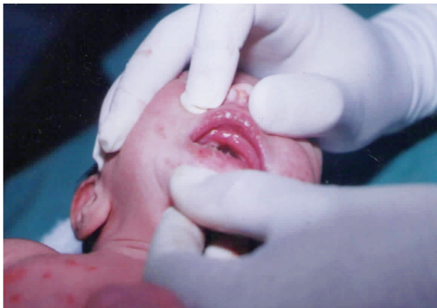
Figure 3 - Clinical presentation: erythematous, eroded lips with tissue tags. Also seen are eroded, crusted lesions on the entire labial mucosa

skin for one minute. The skin biopsy was taken from the area after 10 min. Histopathological examination revealed split localized to the epidermis. The epidermal layer above the split appeared to be normal. The basement membrane was intact, along with normal underlying connective tissue, suggestive of EB (Figure 4).