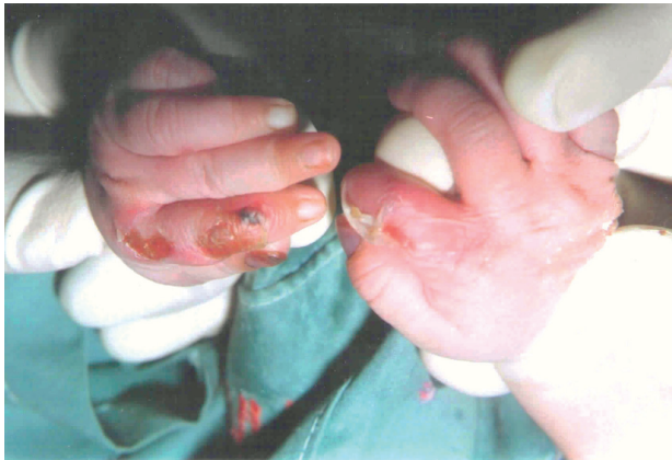
Figure 2 - Clinical presentation: denuded areas distributed over the hands