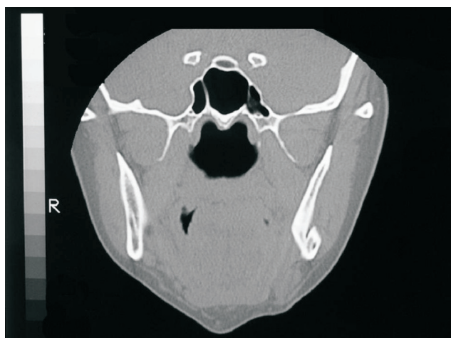
FIGURE 4 - Postoperative computed tomography (36 months)

In the immediate postoperative period, the patient presented with paresis of the lower lip, which had a total regression after nine months. After a period of 36 months, no sign of recurrence was observed (Figure 4).