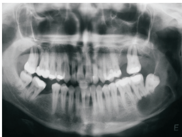
FIGURE 1 - Preoperative panoramic radiograph

A thirty-year-old woman was referred for an evaluation of an osteolytic lesion in the left mandibular ramus. A panoramic radiographic image showed a radiolucent, multilocular, well-defined lesion associated with the crown of an impacted third molar extending to the roots of the second molar (Figure 1).