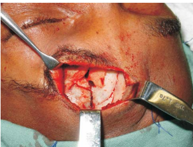
FIGURE 3 - Superciliary surgical approach and fracture exposition

The incision was accomplished deep to the muscular plane. To obtain elasticity without glabellar skin incision, the cutaneous tissue of this area was released by incision of the muscular and periosteal planes until the median line (Figure 3).