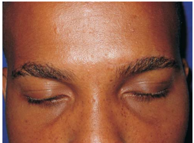
FIGURE 5 - Cicatricial result after surgical incision

After eight months the patient presents sinus physiology, adequate frontal contour and satisfactory aesthetic results (Figure 5).