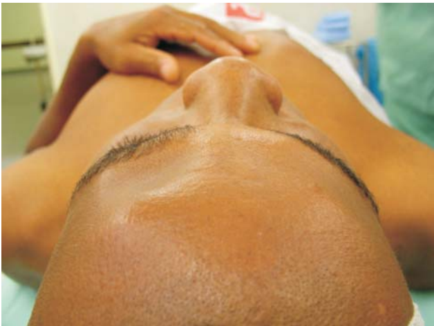
FIGURE 2 - Clinical aspect of the fracture after edema resolution

After resolution of the edema, a frontal depression was observed, leading to the need of surgical exploration due to functional and aesthetic impairment (Figure 2). Since the fracture lines did not compromise the frontal sinus floor and the frontonasal duct, sinus obliteration was not considered, restricting the surgery to the reconstruction of the fractured area. A single superciliary incision over the eyebrow was chosen.