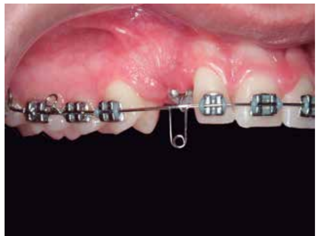
Figure 7 - Crown perforation

Although the periodontal-orthodontic approach is the most frequent treatment not all maxillary canine teeth are good for traction. In cases where the tooth presents a severe horizontal position; ankylosis; external root resorption; root dilaceration, or even when the patient does not want to undergo orthodontic treatment, extraction of the impacted canine must be considered (4, 16, 38).