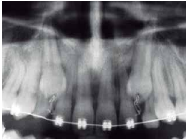
Figure 10 - Radiographic image of the use of cantilever