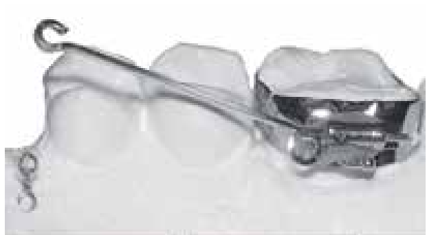
Figure 12 - Palatal view of the cantilever