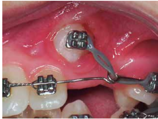
Figure 1 - Open surgical technique

There are many forms for aligning the upper impacted canines to its normal axial inclination such as palatine arches provided with handles in the tubes entrance (12), auxiliary arches incorporating loops superposed to the base arch (34, 35), ballista spring system (19, 36), springs soldered to the main archwire (35), superelastic wires (19, 35) and cantilevers (35); removable appliances (33); use of intra or intermaxillar anchorage and the utilization of bone integrated implants and magnets (Figures