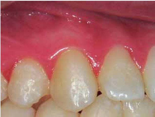
Figure 5 - Periodontal aspect of the closed surgical technique in lateral view