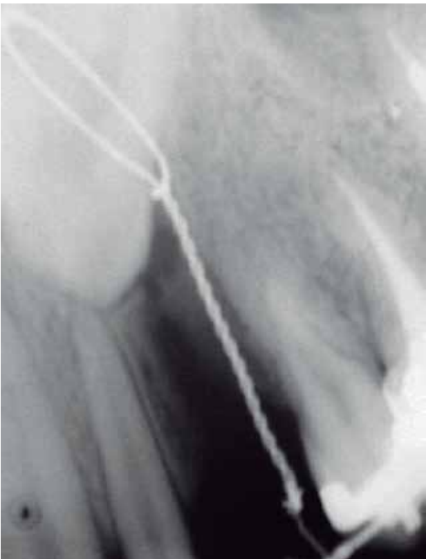
Figure 9 - Occlusal view of cantilever