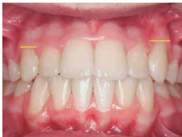
Figure 3 - Periodontal aspect of the open surgical technique in frontal view