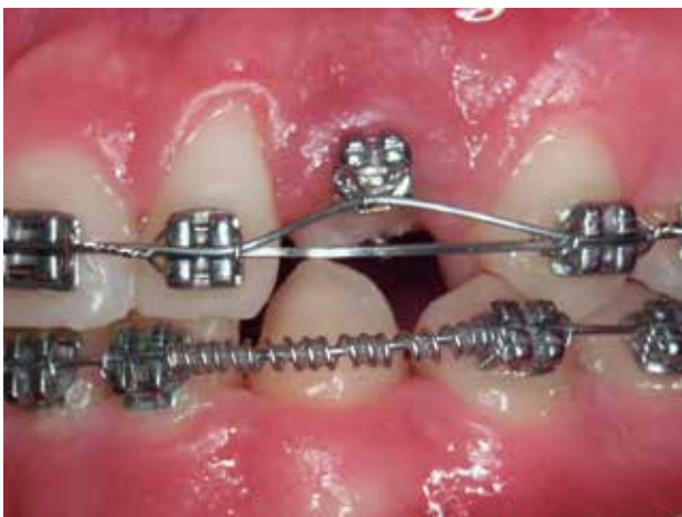
Figure 6 - Obsolete method of wire ligation