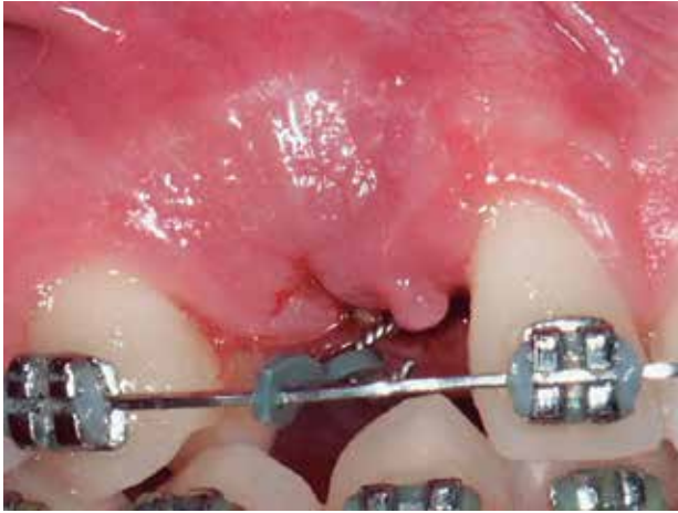
Figure 4 - Closed surgical technique