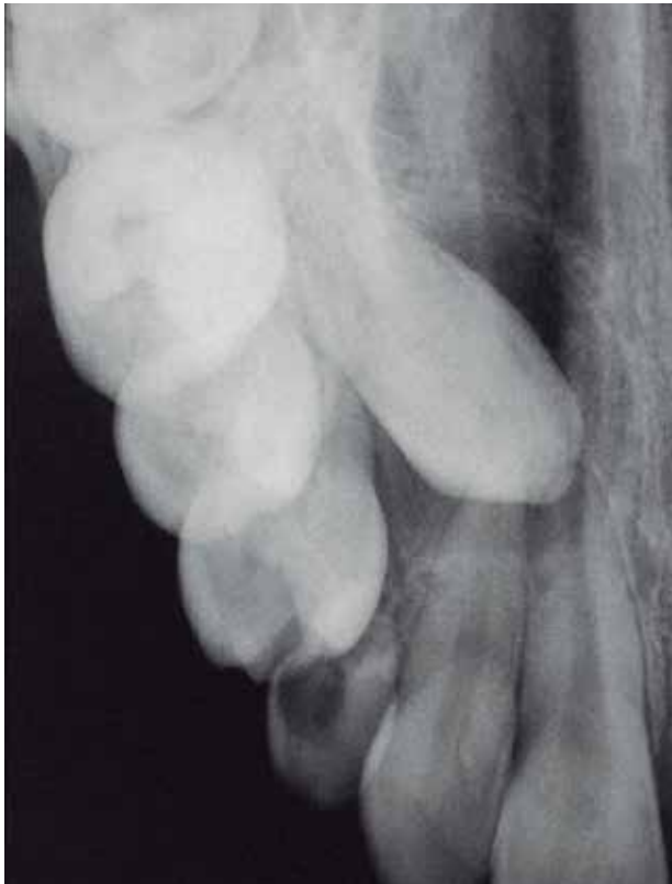
Figure 13 - Superposed archwire of Kornhauser