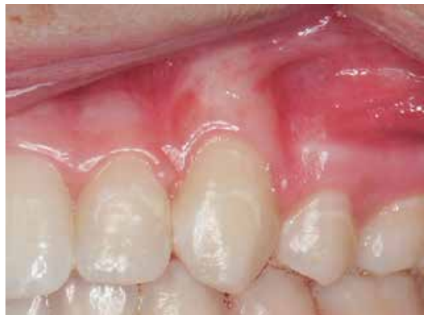
Figure 2 - Periodontal aspect of the open surgical technique in lateral view