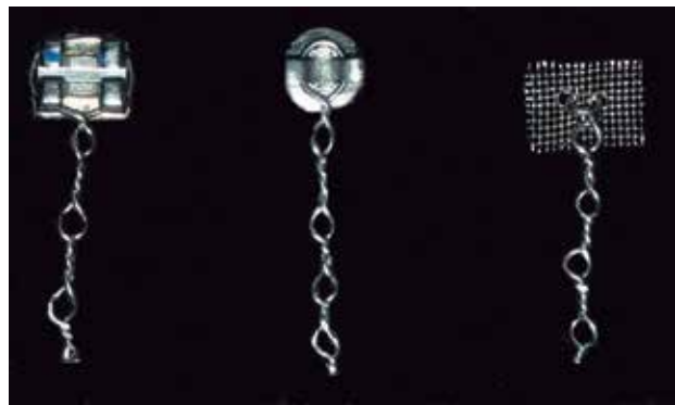
Figure 11 - Examples of attachments Source: Research data.