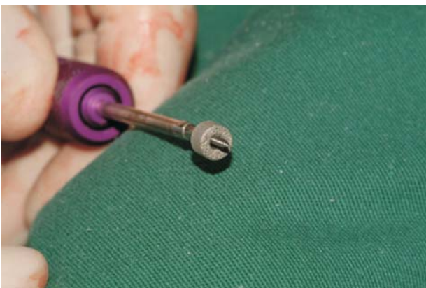
FIGURE 1 - Coin-shaped titanium implants (4 mm in thickness and 6 mm in diameter) with a 3 mm screw in the through hole located in the center area of the implant for cortical bone fixation

Coin-shaped titanium (ASTM grade 4) implants, 4 mm thick and 6 mm in diameter, were produced by a Brazilian dental implant manufacturer. A 3 mm screw was adapted to a through hole made in the center of all implants to ensure contact and fixation of the implants to the cortical bone. The new design coin-shaped of implants was developed in order to increase the contact area between the implant surface and the cortical bone and avoiding the shear forces that act on titanium screws routinely used in dental implants (2, 3). The coin-shaped titanium implants are shown in Figure 1.