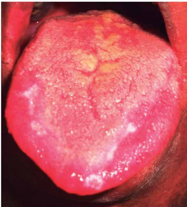
Figura 2 - Healed lesion after follow up

extraordinary, generalized eruption with continued fever and inflamed buccal mucosa. SJS had for years been considered an extreme variant of erythema multiforme (EM), with Toxic Epidermal Necrolysis (TEN) being a different entity (3).