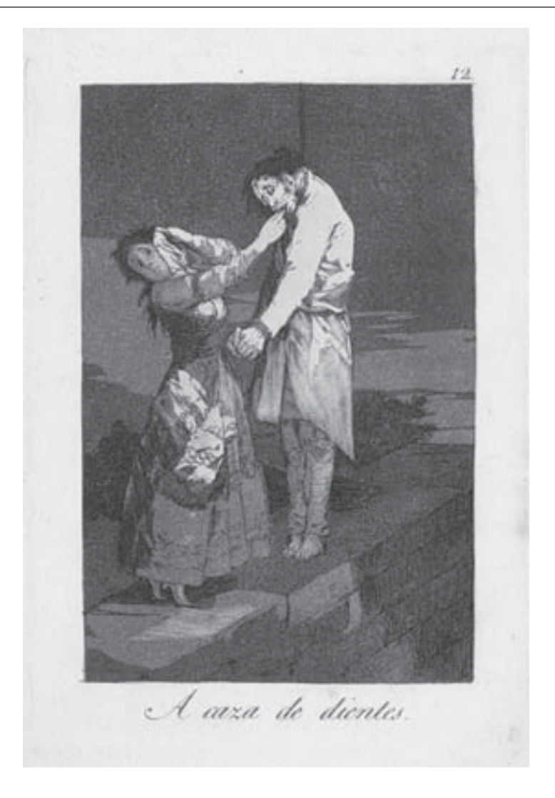
One Hunting for Teeth: Plate 12 of Los Caprichos , first edition, 1799 Francisco de Goya y Lucientes (Spanish, 1746–1828)