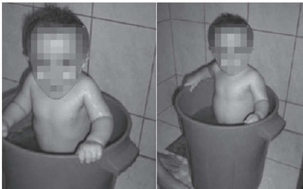
Figure 1 - Adapted devices

For example, faced with the descriptions of one family regarding the difficulty to reestablish the walking of their child after a fracture, since he did not want in any way to resume putting his feet on the ground and to recommence his routine, we requested information about the daily life of their son including the times of the day when he became more relaxed. In unison they responded that only during bathing did he relax a little more, risking some movements to play, however, remained sitting. Therefore, we planned daily bathing with the use of a large, resistant, plastic pail, compatible with the height and ability of the child, with sufficient water to cover approximately half of the trunk and supported by a non-slip mat to provide stability (Figure 1). With immersion, this patient benefited from movements in the standing position, performed squats, lateral walking safely inside the bucket and worked on muscle strength. In addition to the good acceptance by the child, the use of this device promoted increased interaction with the family, helping to reveal the natural abilities and efficiency of movement, with the patient freely reinitiating walking in other places, which resulted in loss of the fear of playing in diverse environments, such as playgrounds and party houses, leading to him to interact with other children.