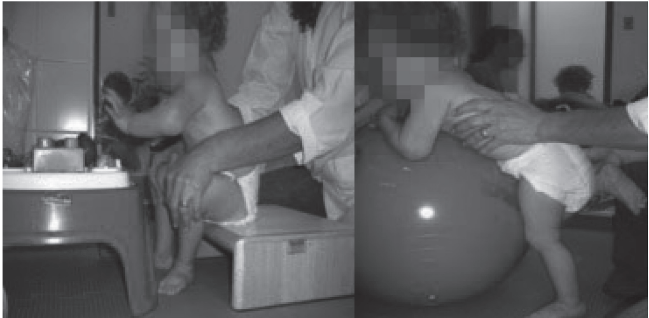
Figure 5 - Manipulation of objects and toys

In these moments we are attentive to whether they perform activities with the best possible biomechanical alignment, while simultaneously working the muscle groups required to maintain good posture and stimulate functional independence. Thus, convinced that, as with motor control, motor learning arises from a complex process of perception, cognition and action (25), we aim to provide all the stimuli, seeking these aspects and also that the activities and positions have enough time to occur, through the processes involved in the interaction of the body systems and the environment.