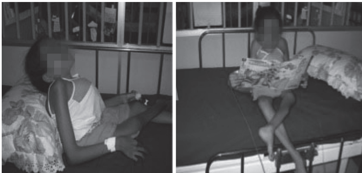
Figure 3 - Sitting posture without support

In accordance with such assertions, we always propose a functionally relevant approach. We suggest the manipulation of objects and toys, starting with the most simple and light, gradually introducing the more complex and heavy, in order to retain the child’s attention and increase the length of the handling (Figure 5).