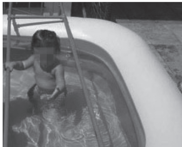
Figure 2 - Walking in water

We highlight that the success of this experience led us to the idea of encouraging the practice of swimming for children and adolescents who expressed willingness to practice some type of sport, however, were faced with the barriers imposed by the majority of them, such as high impact, the collision of bodies and possible falls. The guidance for this practice was only indicated for those with motor qualities and also