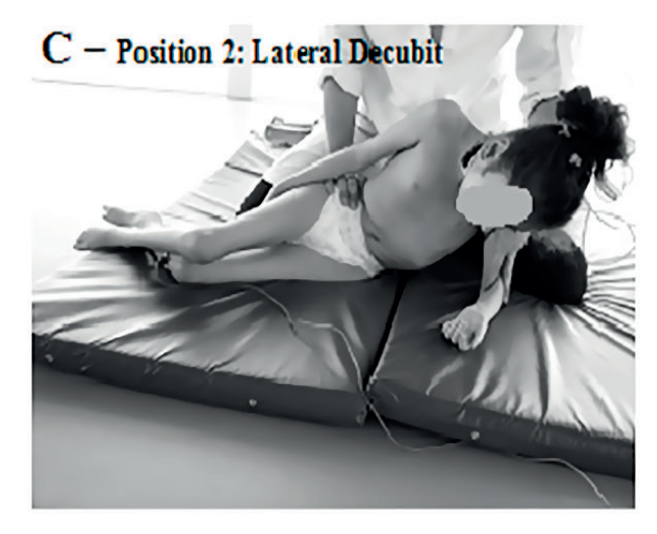
Figure 1 - A) Location of the electrodes for recording activity of extensor and flexor muscles at the C7 and T10 levels and the sternocleidomastoid muscle (SCM); B) Representation of posture 1 recording in the prone position on the wedge; C) Representation of position 2 recording in the lateral decubit on the floor.