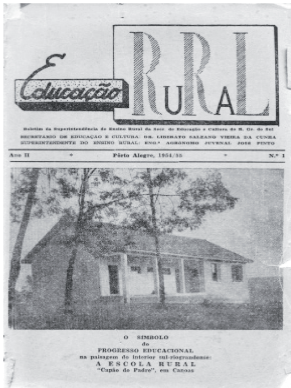
Figure 2 - Cover of the Boletim de Educação Rural 1954/1955