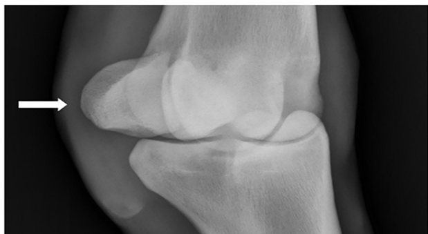
Figure 1 - Radiographic image of a Thoroughbred racehorse's fetlock joint without changes in the lateral sesamoid bone (arrow) (score 0).