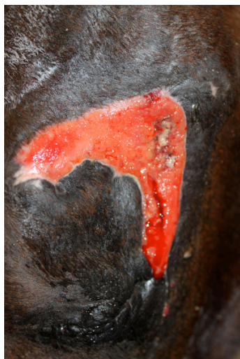
Figure 5 - Thirteen-days after the surgery. Perimeter of the surgical wound was 18 cm and a significant reduction of the wound site.