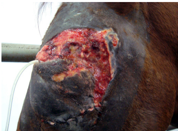
Figure 4 - Significant healing response after seven days of membrane use. Formation of granulation tissue without significant reduction of wound bed is observed. The perimeter wound site was 29 cm.

A significant healing response was noted, as the wound perimeter was reduced from 33 cm to 29 cm after seven-days of membrane use (Figure 4). Thirteen days after the surgery, bony microfragments were still present and were removed from the wound bed (Figure 5). After 51 days of postoperative care and hydrocolloid membrane use, the wound had a normal epithelial covering and was completely healed (Figure 6).