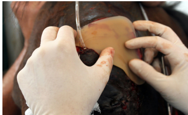
Figure 3 - Hydrocolloid dressing (Curatec™) use after cleaning. Perimeter of the surgical wound was 33 cm.