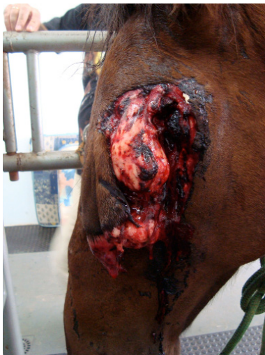
Figure 1 - Horse showing severe facial edema and a partial laceration of the left cheek with eyeball contour.

Preliminary examination suggested the need for reconstructive facial surgery and enucleation. Upon further physical examination and complete blood count and chemistry analysis, we elected not to perform general anesthesia as the animal was anemic and lateral recumbency was used to prevent respiratory tract edema. After administration of ketoprofen (2.2 mg/kg IV) the lesions were evaluated, the wound was cleaned with 0.9% saline solution and a solution of calendula ( Calendula officinalis ), and visible bone fragments were removed.