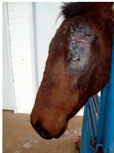
Figure 6 - Fifty-one days of postoperative and hydrocolloid membrane use. Normal epithelial cover and nearly complete wound healing and a wound perimeter of 1cm were observed.

The wound was not infected during the entire acute inflammation and cellular proliferation phase. However, 41 days after surgery the wound had a minor fluid secretion. We proceeded to clean the wound with a 1:1000 calendula solution and applied a new hydrocolloid dressing on the 42nd day. The inability to stabilise the frontal and maxillary sinuses bones in addition to the loss of the lacrimal duct induced a sinusitis in the horse, which we believe led to the local infection.