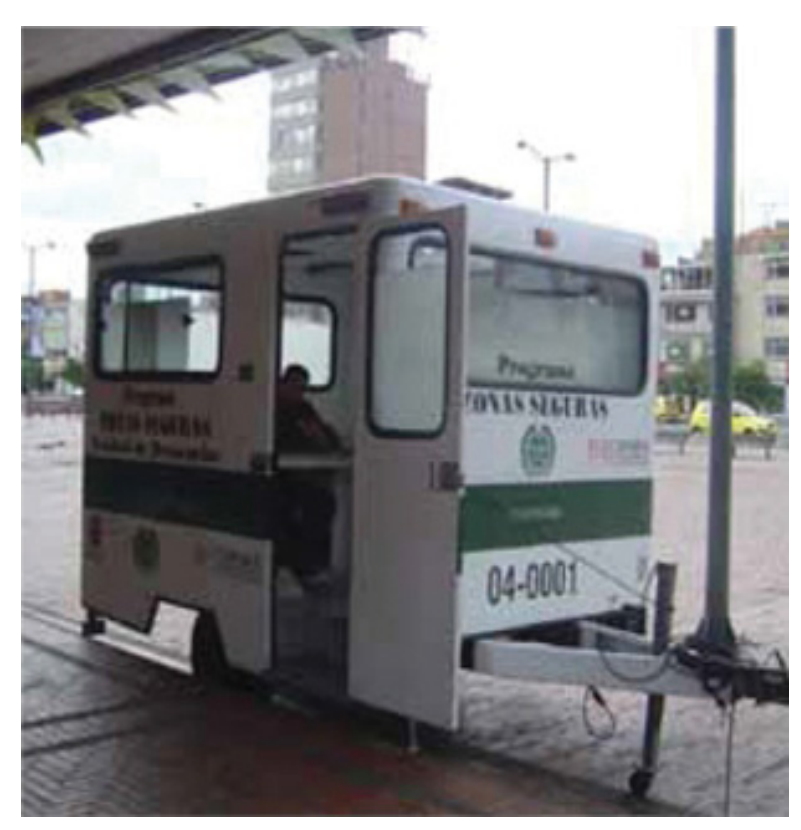
Figure 4 - Mobile police facility, Bogotá, Colombia