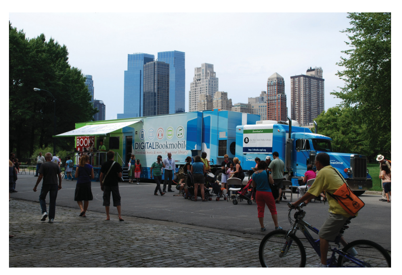
Figure 5 - Urban mobile library

municipalities of Cali and Bogotá, Colombia, where small, mobile police units, crime scene investigation facilities, and professional cohorts (Figure 4) have been installed to provide surveillance, legal procedures, and assistance in the resolution of everyday conflicts (MARC; WILLMAN, 2010). The