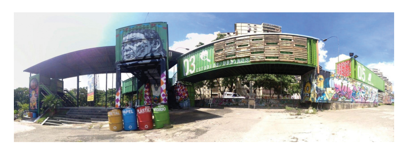
Figure 7 - Labrotorio de Artes Urbano , El Valle, Caracas

Accordingly, spatial intervention should focus on enhancing the accessibility of recreational facilities since exposure to such facilities offers the opportunity to form social norms while providing verbal skills that enable individuals to "[...] express feelings and manage conflicts through negotiation and agreement [...]" (BRICEÑO-LEÓN, 2005, p. 1643). Precedent for such facilities can be drawn from existing programs, including the initiative Labrotorio de Artes Urbano (Tiuna El Fuerte) in Caracas, which provides a space in which the values of creativity, expression, and respect are encouraged in young urban inhabitants (Figure 7) (LABROTORIO DE ARTES URBANO, 2013). Through programs including instruction on graffiti artwork, music, radio broadcasting, and dance as well as other artistic media, Tiuna El Fuerte has been able to reach a substantial portion of local adolescents who do not attend school or participate in athletic or cultural activities. Furthermore, Tiuna El Fuerte programs encourage youth to amend the spaces of the facility to represent the culture of their