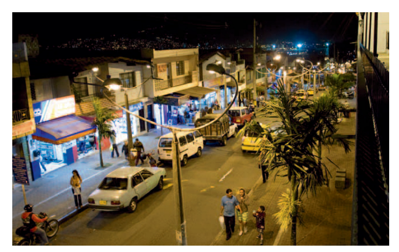
Figure 6 - Enhanced public life in Medellín, Colombia

expressions of cultural violence and likewise achieved relative success (MARC; WILLMAN, 2010, p. 92).