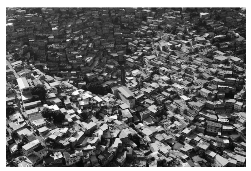
Figure 3 - The extreme congestion of the barrios

[...] a process of generalized urban deterioration set in, where congestion and decline, [caused] by the decreasing availability of urban plots, [saw] families resort to building 2, 3, or even 7 stories on to already precarious dwellings [...] (BRICEÑO-LEÓN, 2007, p. 99).