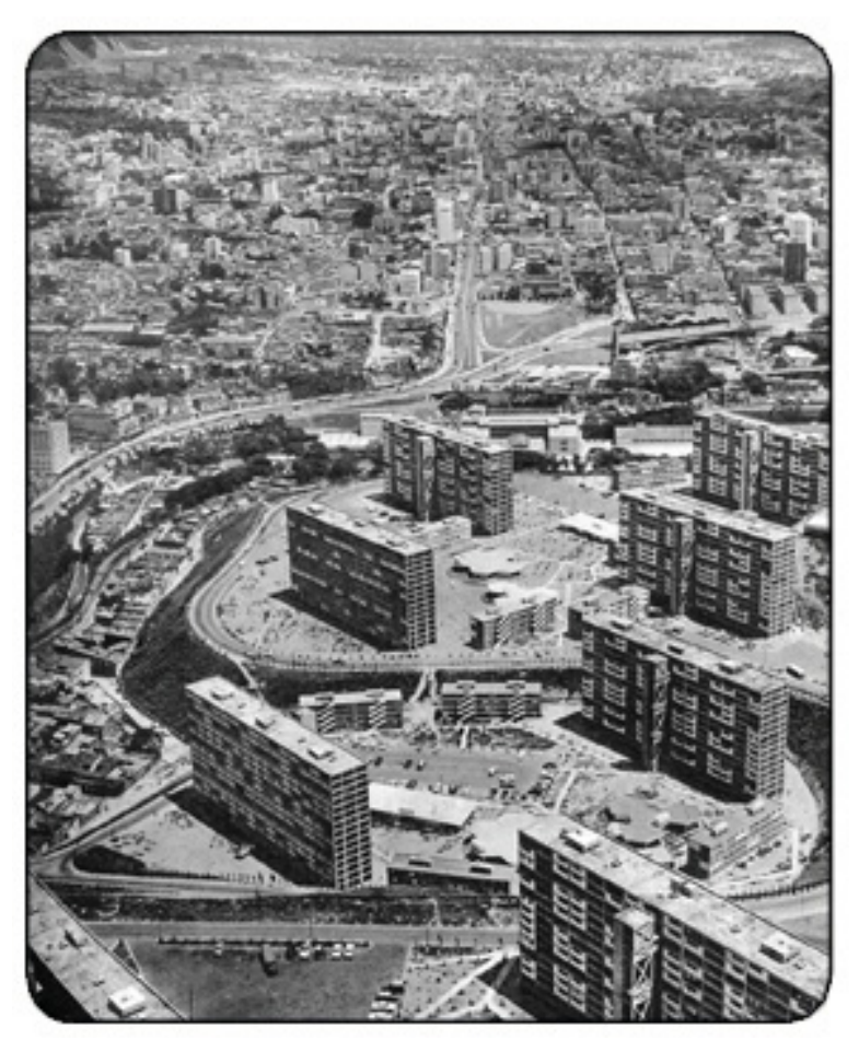
Figure 2 - The Super Bloque of January 23 shortly after construction

The contemporary exacerbation of urban insecurity in Caracas can be significantly attributed to processes of spatial organization that have occurred since the early 20th century. By the beginning of the 1930s, oil and the state had come to dominate the economy and processes of urban expansion in Caracas (BRICEÑO-LEÓN, 2007). Programs such as the Plan Rotival, which sought to order urban expansion through a system of straight boulevards and diagonal avenues, epitomized this trend, as government policy reserved the city center for commercial and office use and pushed the metropolis into its modern linear shape, which made urban transportation necessary for city life (STANN, 1975). The purchase of large single tracts of land in the city's east and their simultaneous subdivision and development into housing at a relatively narrow