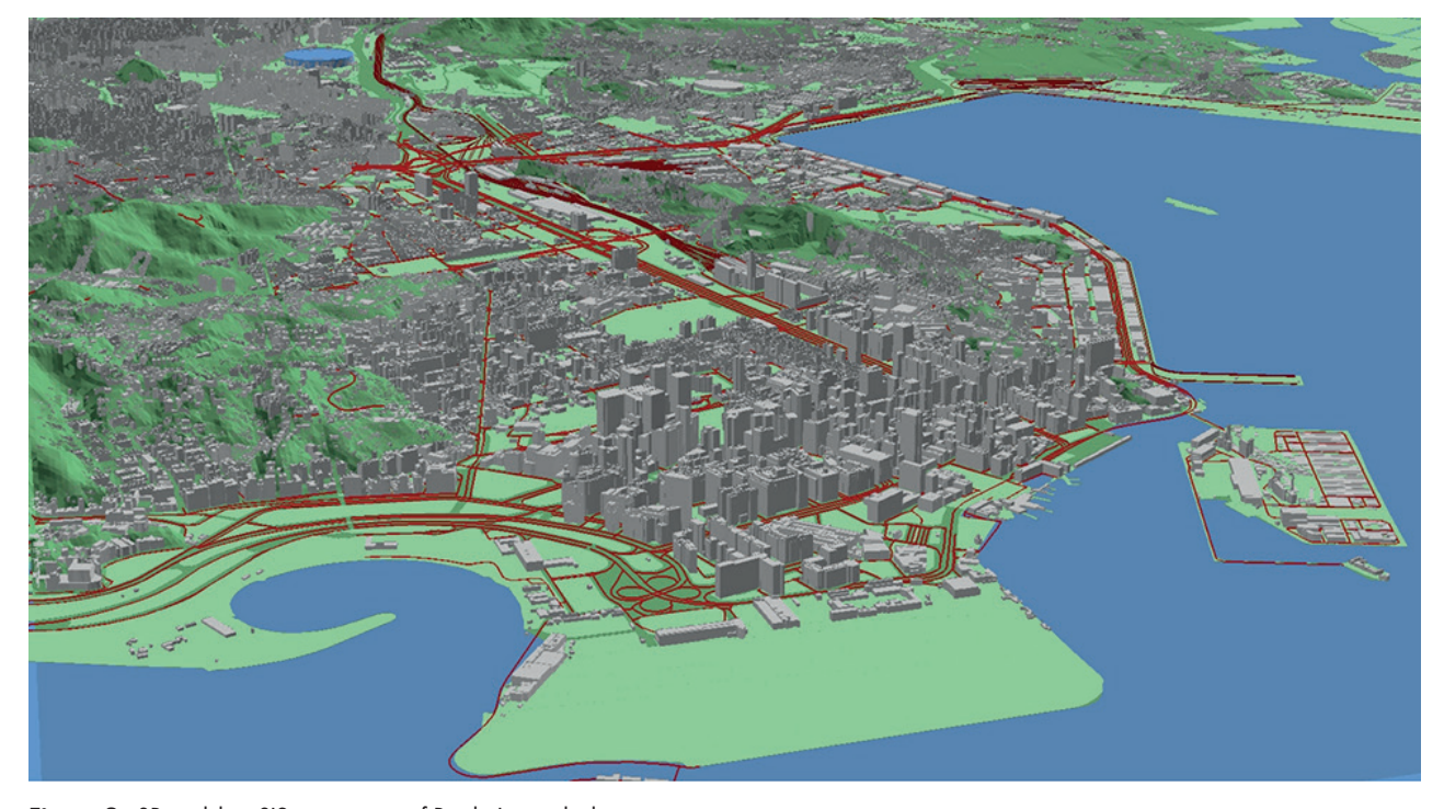
Figure 2 - 3D model on GIS environment of Rio de Janeiro harbor area

which have to be dealt with to ensure the safety of neighbouring population.