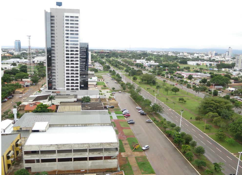
Figure 7 - Palmas main axis, 2017.

The central main square, the civic centre, depicts buildings scattered amid parking areas and green pedestrian zones. It reproduces the modernist city space with its continuous void and dispersed buildings. In general, the scale of the city seems oversized (Reis, 2015b, p. 126); for example, the main urban axis – two avenues of four lanes each, plus parking areas on each side, median strip and compulsory setbacks – amounts to a width of 150 meters, while neighbouring buildings are lower than just a few storeys (Figure 7). Total population density in 2011 was roughly 9 inhabitants per hectare (Albieri, 2018, p. 205); even in consolidated blocks it did not surpass 65 inhabitants per hectare (USP, 2008, p. 14).