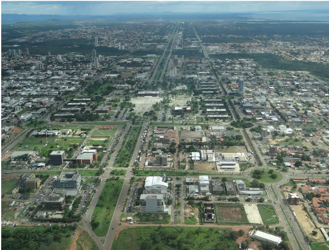
Figure 1 - Aerial view of Palmas, 2015. Governmental Palace in the centre.

Palmas (Figure 1), the capital city of the recently-created state of Tocantins in central Brazil, was designed from scratch in 1989 amid Brazil's re-democratization process, post-modernist criticism of modernist planning and the "functional city", and rising environmental concerns. The end of the military regime (1964-1985) and the promulgation of a new federal constitution in 1988 led to the creation of the new state, and the post-dictatorship period and accompanying economic recession turned the foundation of its capital city into an opportunity for regional development, economic growth and social progress, as the creation of Brasília had done before it.