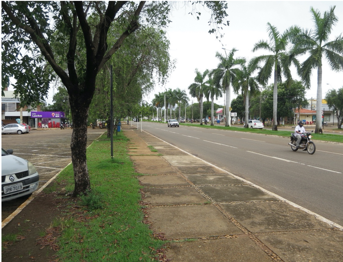
Figure 8 - View of Avenue Juscelino Kubitschek (an East-West commercial road), 2017.

Palmas' neighbourhood units are another legacy of modernist urbanism. Its plan insisted on single-use neighbourhoods when this had long been contested in favour of more urban diversity (Jacobs, 1961). The town layout has allowed diversity in the inner form of its macroblocks – to the extreme of the uniqueness of each macroblock – but not in their uses, which results in reduced vitality. Though avoiding the modernist standardization, the varied outline of the macroblocks lacks legibility.