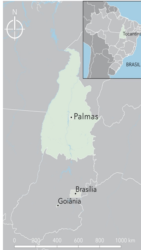
Figure 2 - Map of Tocantins state.