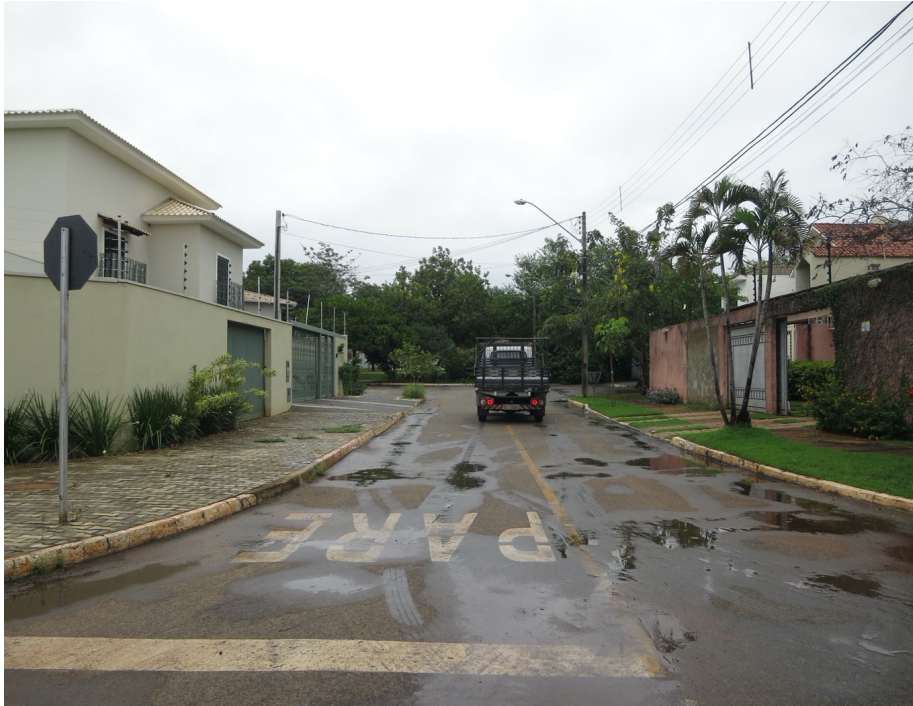
Figure 6 - Internal view of a residential macroblock, 2017.

The central main square, the civic centre, depicts buildings scattered amid parking areas and green pedestrian zones. It reproduces the modernist city space with its continuous void and dispersed buildings. In general, the scale of the city seems oversized (Reis, 2015b, p. 126); for example, the main urban axis – two avenues of four lanes each, plus parking areas on each side, median strip and compulsory setbacks – amounts to a width of 150 meters, while neighbouring buildings are lower than just a few storeys (Figure 7). Total population density in 2011 was roughly 9 inhabitants per hectare (Albieri, 2018, p. 205); even in consolidated blocks it did not surpass 65 inhabitants per hectare (USP, 2008, p. 14).