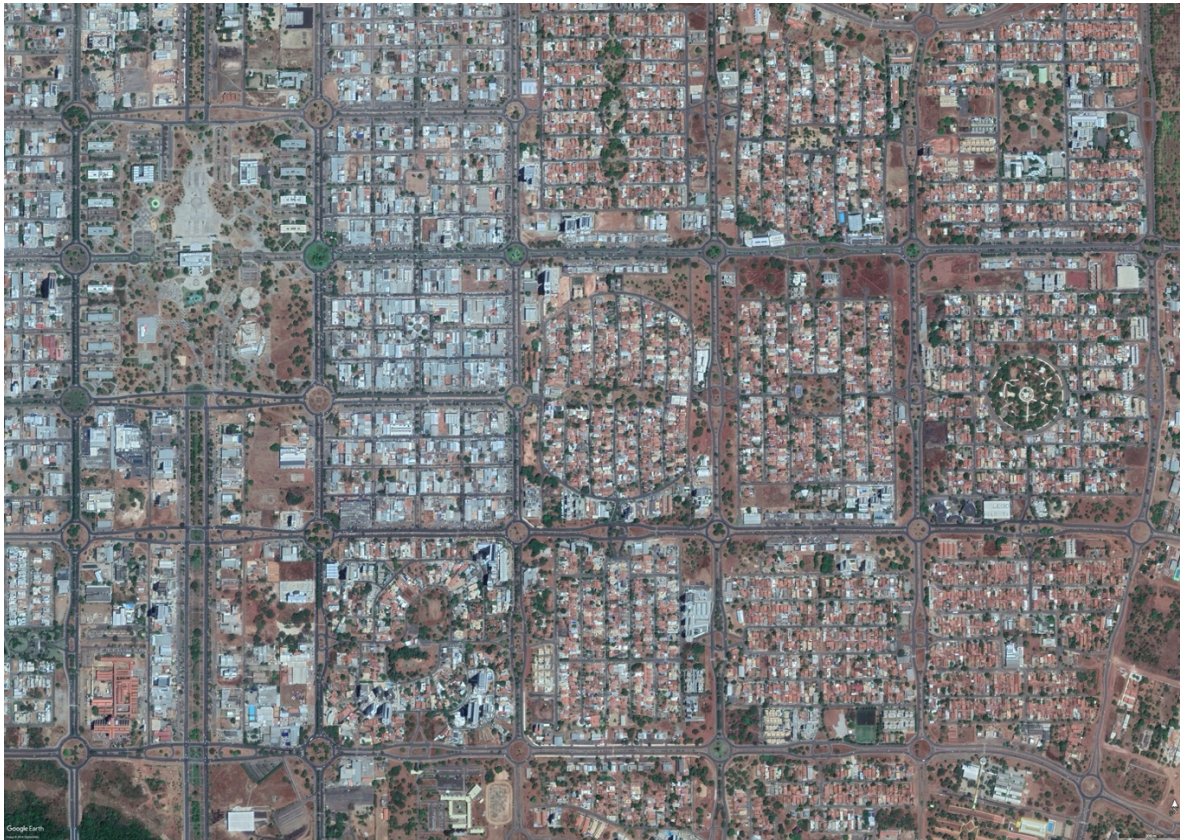
Figure 5 - Aerial view of Palmas: civic centre on the left; commercial block in the centre and residential macroblocks and their unique layout on the right.

Palmas' planners considered the residential areas as a collection of neighbourhoods (Trindade, 2009, p. 67-68) – “[...] an urban agglomerate... constructed according to social contingencies and forces” (Segawa, 1991, p. 94) – and thus insisted on having variety within each macroblock design. Unlike Brasília's superblocks, in Palmas' macroblocks urban land property is private and plot parcelling was to offer distinct forms of spatial organization and internal townscape. Considering the potential need for single-family and multi-family dwellings, distinct residential types were foreseen: detached single houses, grouped houses and apartment buildings (GrupoQuatro, 1991, p. 98).