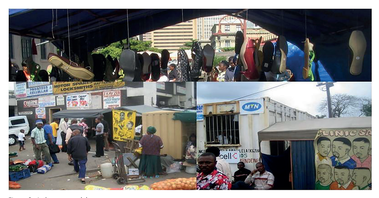
Figure 3 - Agglomerations and clustering

The collage in Figure 5 shows telephone services provided by a trader in a public area adjacent to a shopping center. Chairs are provided for customers; clothes are for sale adjacent to telephony. These