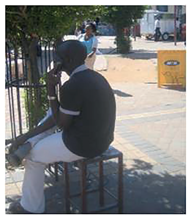
Figure 6 - Public/private

Boundaries between public and private are porous. Below is a street barber customer who chooses to interrupt his haircut, inside the enclosure provided by a tent, to conduct his business telephonically outside in a public space (until a nosy researcher interrupts...).