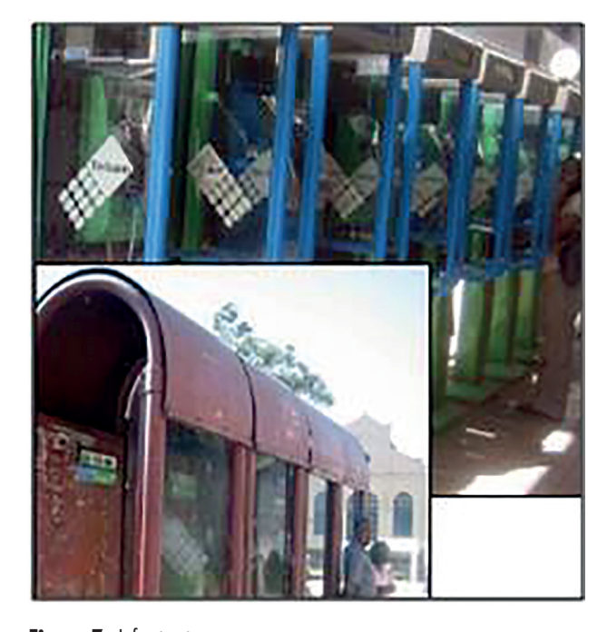
Figure 7 - Infrastructures

Movement between these points (as indicated by the horizontal arrows) is facilitated through physical movement but also underpinned (vertical arrows from below) by the social networks that enable participation in the city's activities. Communication between these physical spaces is facilitated through