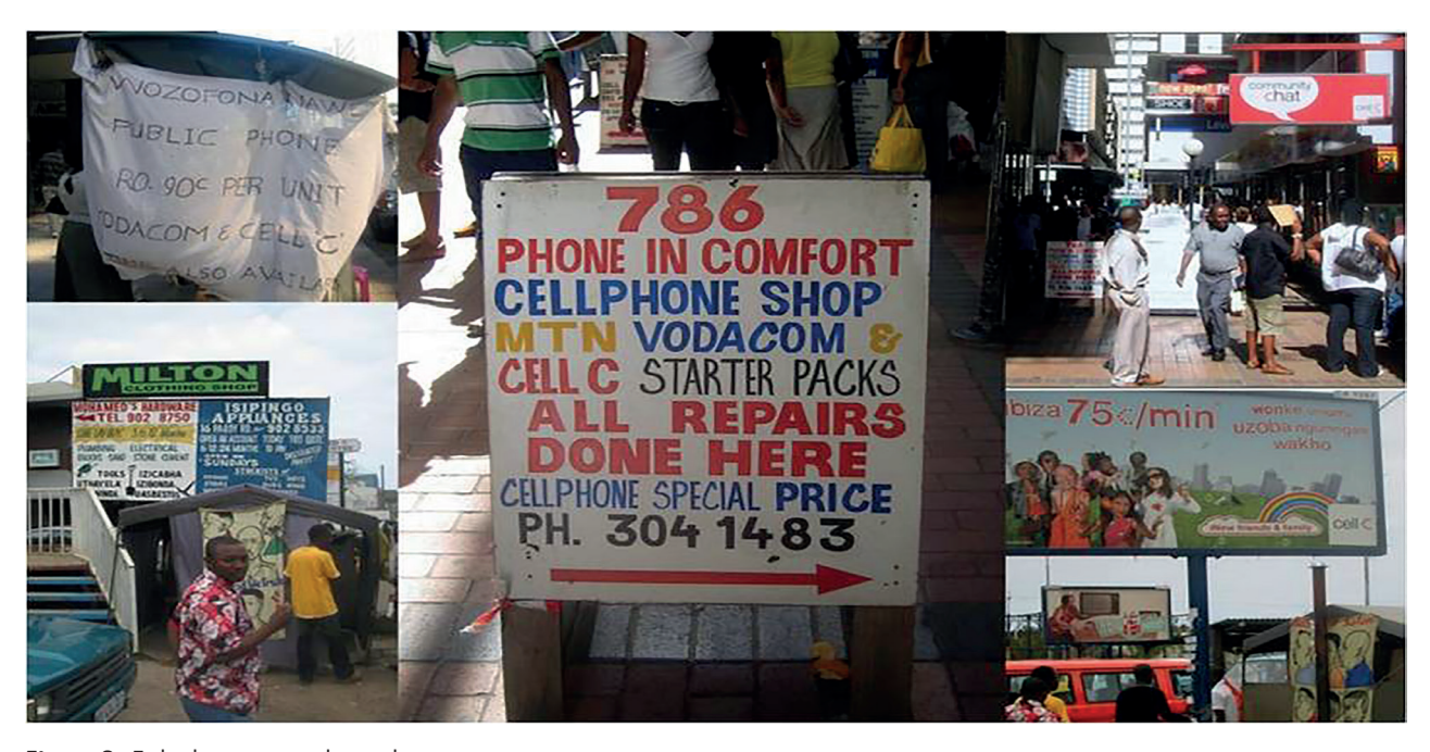
Figure 2 - Technology services advertised

When referring to Figure 2, above right the 'community chat' advertisementusing a service provider