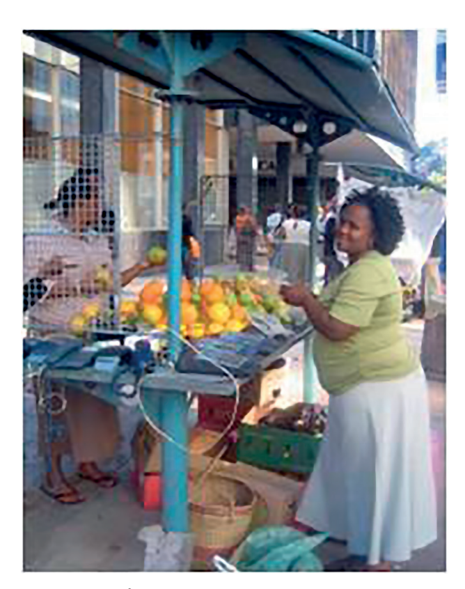
Figure 4 - Diversification

service clusters are social spaces as customers and traders interact and chat. Talking is sociable after all!