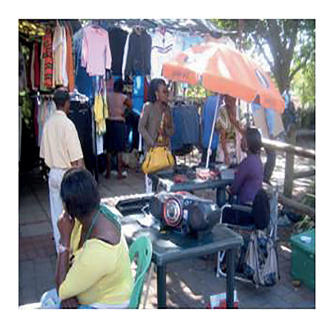
Figure 5 - Social spaces