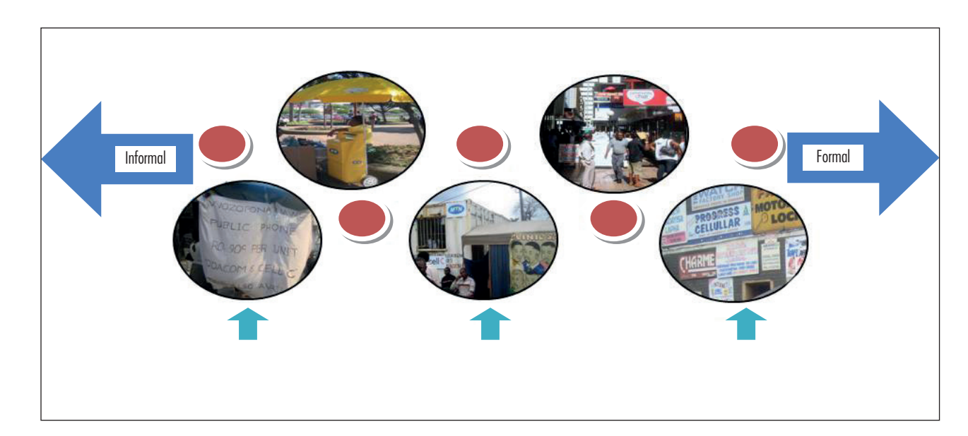
Figure 8 - Telephony and the formal-informal spectrum

The networks that respondents have encountered on their journeys to South Africa reach across scales and provide the means whereby place is traversed.